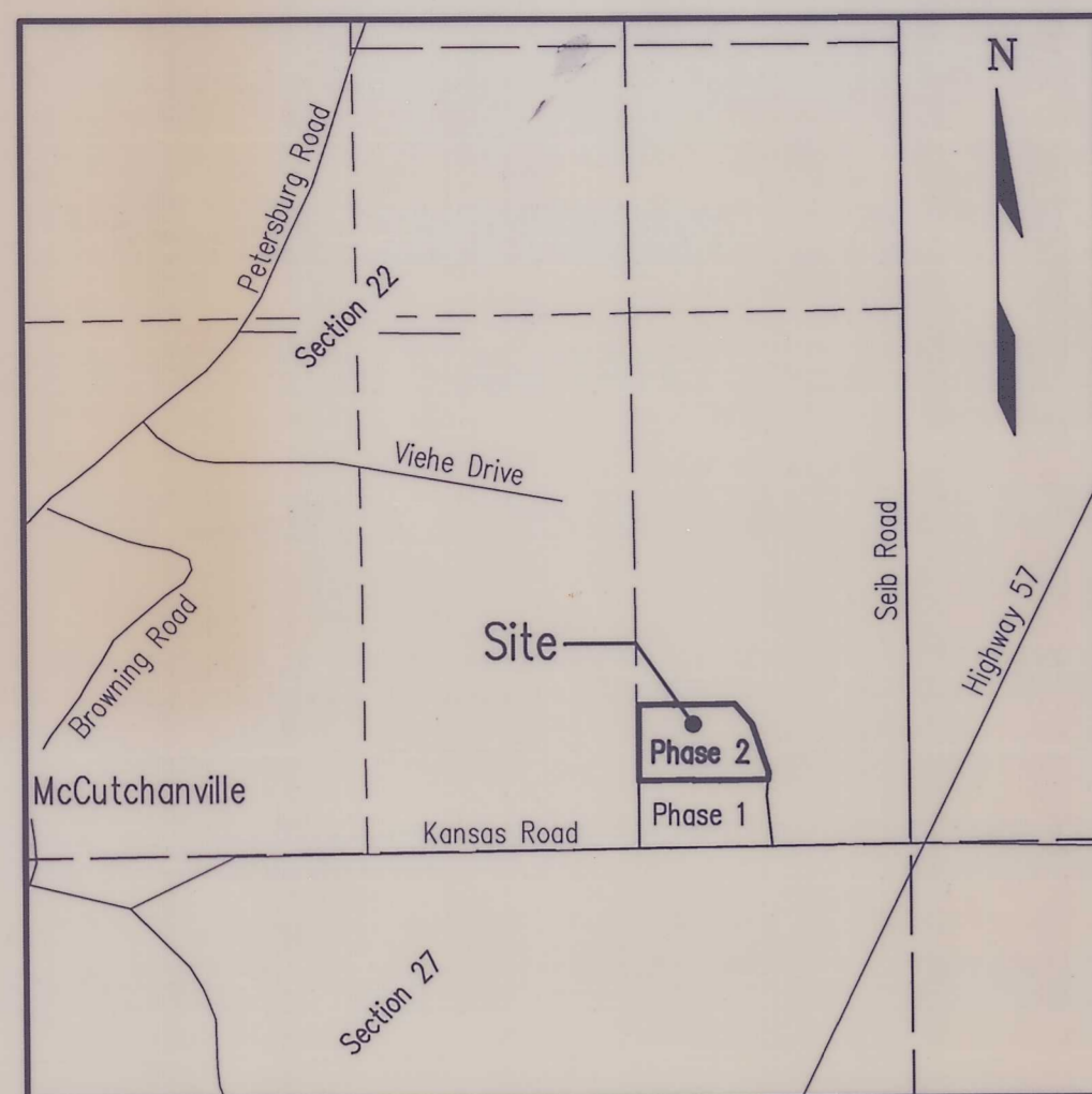
Location Map Scale: 1"=1000'

Stonecreek PUD Section 2, Phase 1 Plat Book Q, page 118