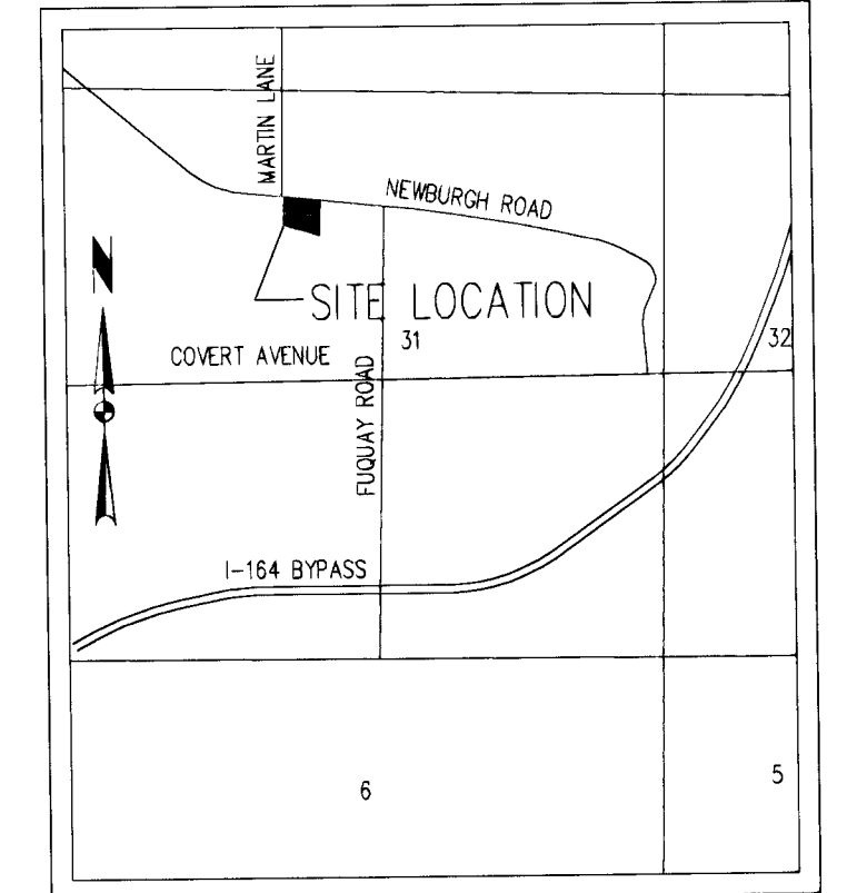
LOCATION MAP SCALE: 1"=2000'