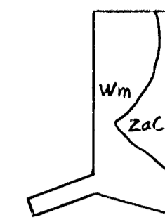
SOIL SURVEY MAP

A SUBDIVISION OF PART OF THE SOUTHWEST QUARTER OF SECTION 21, T-5-S, R-11-W, IN VANDERBURGH COUNTY, INDIANA AND MORE PARTICULARLY DESCRIBED AS FOLLOWS: COMMENCING AT THE NORTHWEST CORNER OF THE EAST HALF OF THE SAID QUARTER SECTION; THENCE SOUTH ALONG THE WEST LINE OF THE EAST HALF OF THE SAID QUARTER SECTION 1088.34 FEET; THENCE N 89° 34' E 60.00 FEET TO THE POINT OF BEGINNING; THENCE N 89° 34' E 215.00 FEET THENCE SOUTH AND PARALLEL TO THE WEST LINE OF THE EAST HALF OF THE SAID QUARTER SECTION 425.00 FEET; THENCE N 89° 17' 15" W 215.01 FEET THENCE S 70° 13' 36" W 143.87 FEET TO THE CENTER OF THE ST. WENDELL ROAD; THENCE N 22° 59' 18" WEST ALONG THE CENTER OF SAID ROAD 50.08 FEET; THENCE N 70° 13' 36" E 164.65 FEET; THENCE NORTH AND PARALLEL TO THE WEST LINE OF THE EAST HALF OF THE SAID QUARTER SECTION 367.57 FEET TO THE POINT OF BEGINNING.