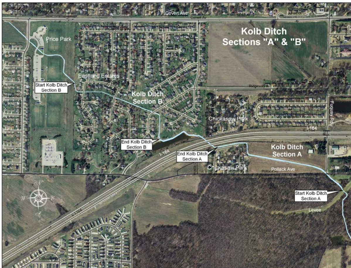
(Larger map at end of 2010 SECTION SP-200.)

The Bidder shall attach the corresponding Bid Schedule to properly executed Bid Form 96 (Revised 2005).